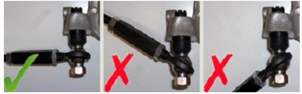
3. Tighten down the 5/8-18 Jam Nut (9) on each end of the Tie Rod End.

There are four Spacers in the kit: 1/8 in (3), two ¼ in (4), and ½ in (5). Use any number or combination of them to achieve the proper bumpsteer setting for your car. Verify there are no clearance issues with the knuckle, subframe, or other suspension arms before putting the car back on the ground. Make sure that the inner tie rod end can articulate freely. The picture below is for illustration purposes only, but it shows proper and improper static position of the rod end bearing. Next, tighten the 5/8-18 Locknut (10) on the bottom of the Tie Rod End Stud to 80 ft-lbs. This will take some effort as it is a crimping locknut.