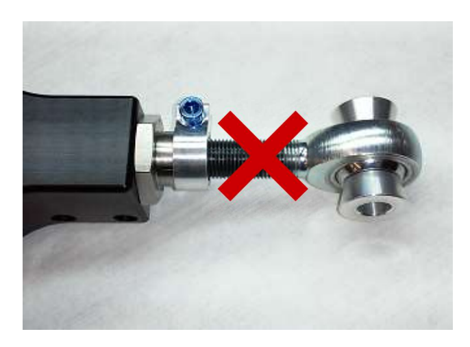
Overextended rod end.