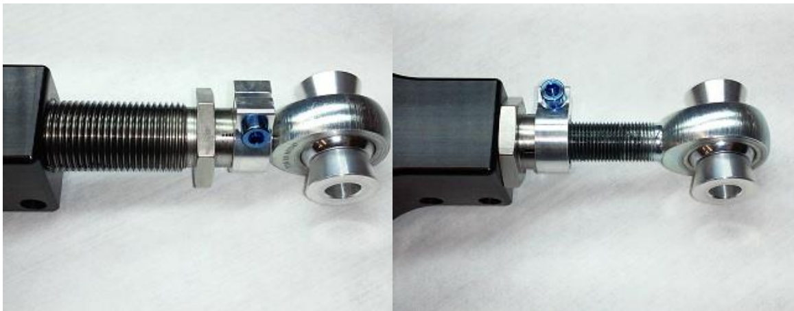
Overextended rod end.

The hybrid adjuster is what is known as a double adjuster . On the outside, the thread is left-handed. On the inside, the thread is right-handed. When the suspension arm is installed, turning the hybrid adjuster will allow you to lengthen/shorten the assembly. When lengthening/shortening, be sure to keep the arm and rod end from freely rotating when you turn the adjuster. Do not make the following mistakes (threading out only the adjuster or threading out only the rod end):