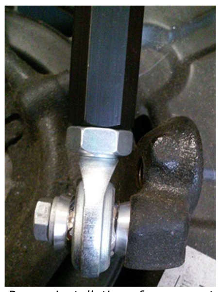
Proper installation of spacers at knuckle.

Do not exceed 20 ft.-lbs . when tightening the link to the car. Leave one endlink bolt disconnected (other endlink bolts should be connected). Place the car (all 4 wheels) on flat ground, then adjust the length of the disconnected endlink until the bolt inserts easily into the sway bar. That will be the length setting to use. Assemble and tighten that endlink accordingly. Torque the Jam Nut (2 or 3) (length setting of endlink) to 20-30 ft.-lbs. DO NOT OVERTORQUE! SPL Parts is not