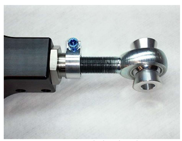
Overextended rod end.