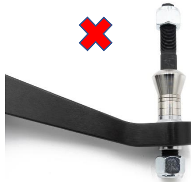
Too many spacers above bearing