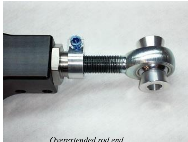
Overextended rod end.