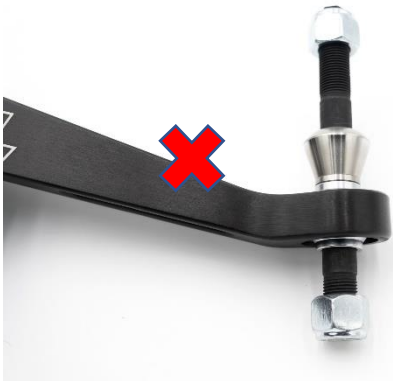
Not all spacers were used