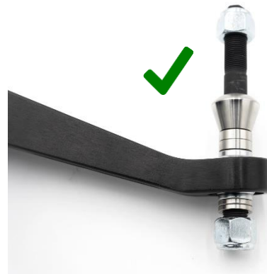
Maximum Roll Center Correction