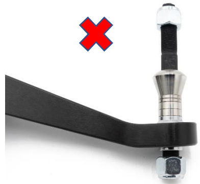
Too many spacers above bearing