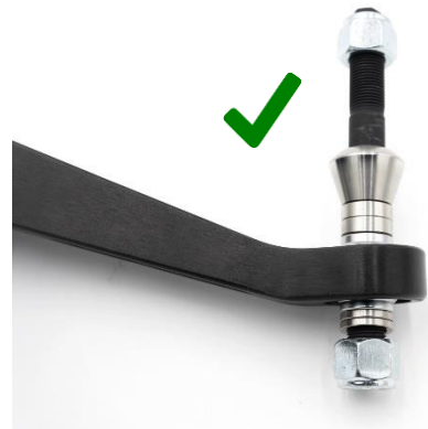
Maximum Roll Center Correction