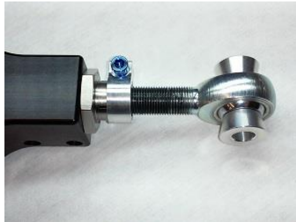
Overextended rod end.