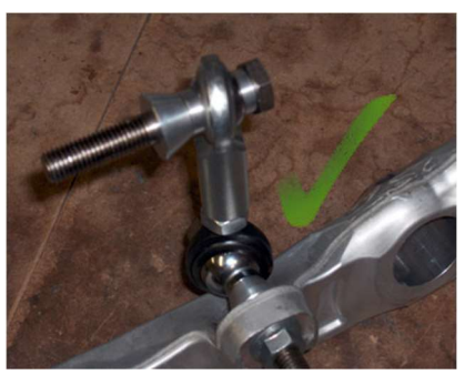
Be safe and enjoy your new upgrade!