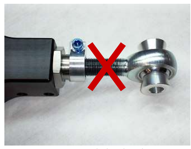
Overextended rod end.