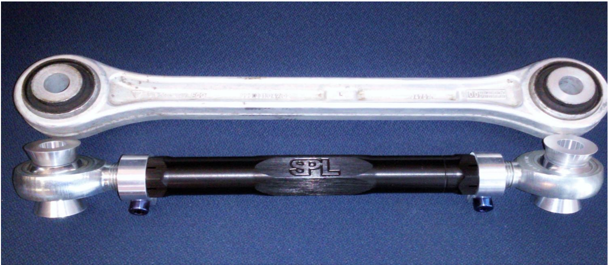
Try to match length of new link to that of old, center to center of the bores.